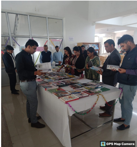
GPS Map Camera Jaipur, Rajasthan, India B 581, J D A Colony, Paidi Meena, Jaipur, Rajasthan 302031, India Lat 26.878662° Long 76.90216° 29/02/24 03:44 PM GMT +05:30 Google