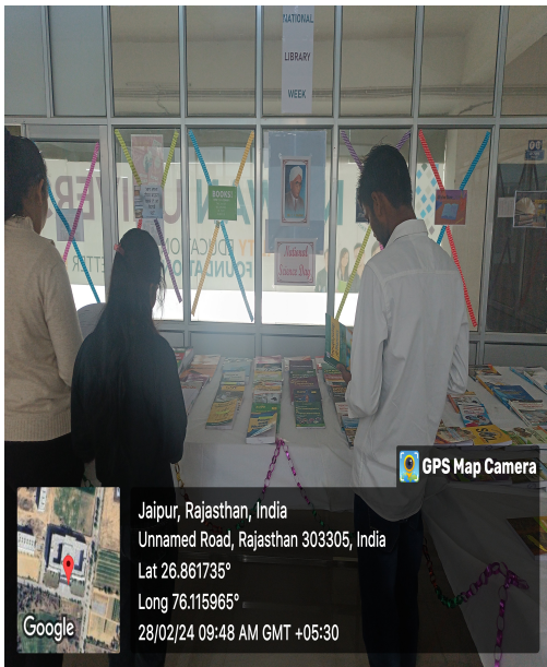
GPS Map Camera Jaipur, Rajasthan, India Unnamed Road, Rajasthan 303305, India Lat 26.861735° Long 76.115965° 28/02/24 09:48 AM GMT +05:30 Google