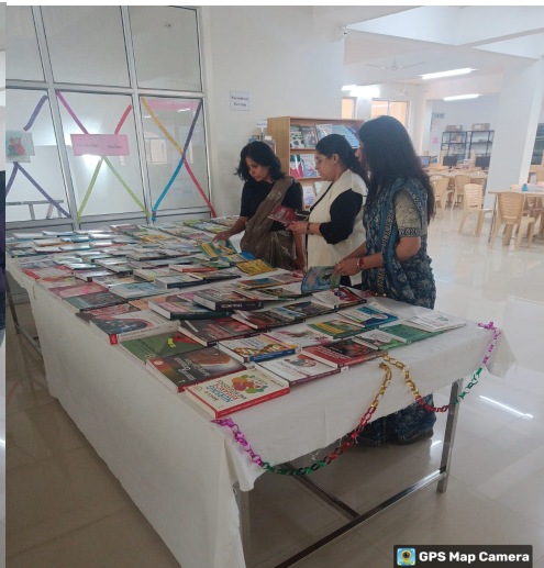
GPS Map Camera Jaipur, Rajasthan, India Unnamed Road, Rajasthan 303305, India Lat 26.861747° Long 76.115929° 28/02/24 04:24 PM GMT +05:30 Google