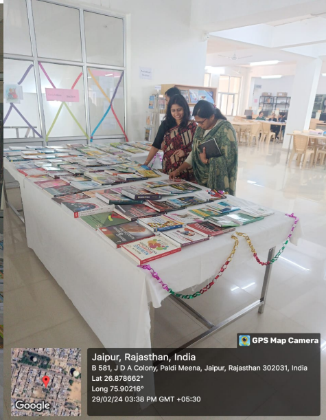
GPS Map Camera Jaipur, Rajasthan, India B 581, J D A Colony, Paidi Meena, Jaipur, Rajasthan 302031, India Lat 26.878662° Long 76.90216° 29/02/24 03:38 PM GMT +05:30 Google